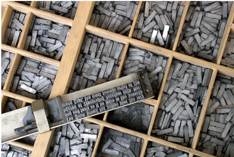
Composing stick and job case. The backbone of early typesetting for letterpress printing.